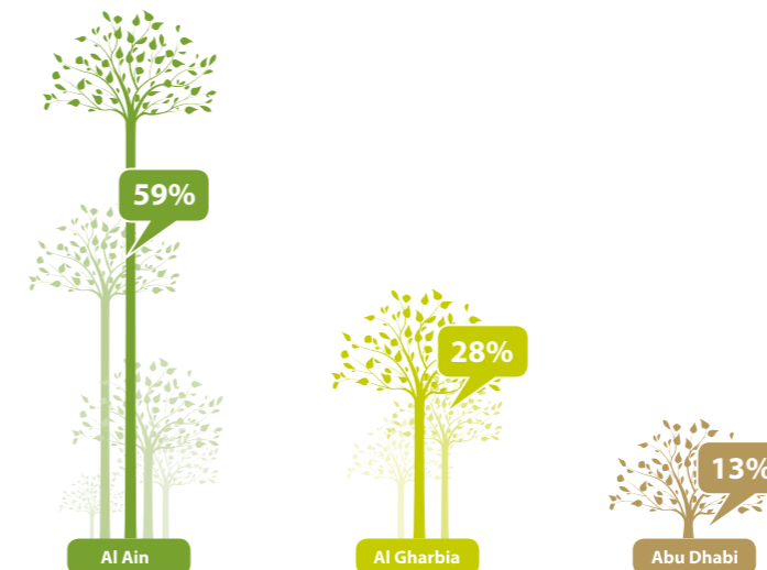
Percentage distribution of agricultural holdings area by region, 2012