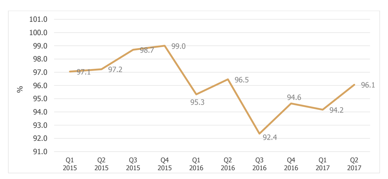
Figure 1: Construction Cost Index, quarterly for 2015, 2016 and 2017