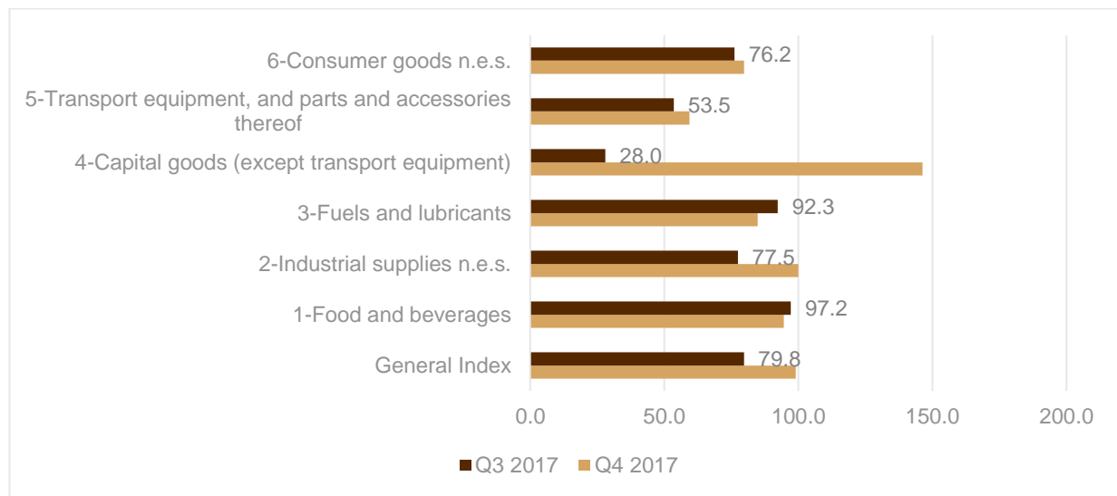
Figure 2: The Export Unit Value Index for the third and fourth quarters of 2017 by classification of "Broad Economic Categories"