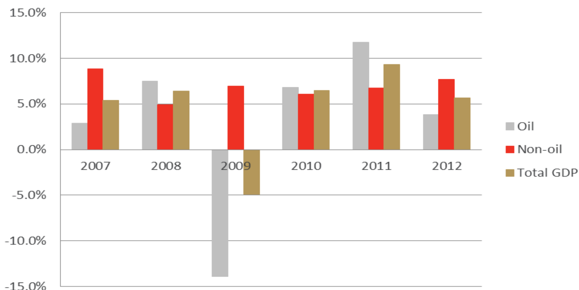
Graph 2: GDP growth in constant 2007 prices